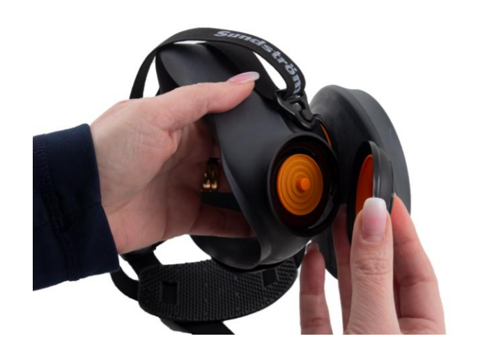
5.1 Remove the protective cap.