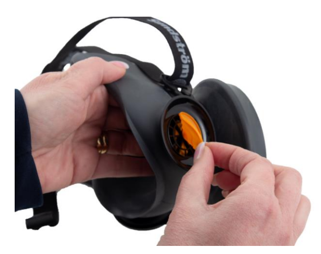
5.2 Prise off the membranes.