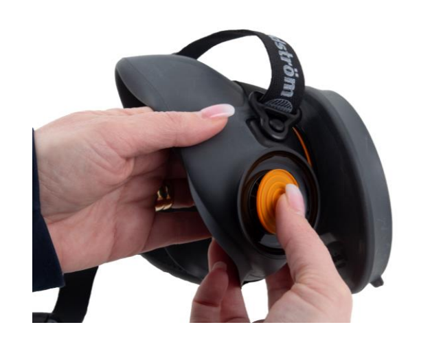
5.3 Press the new membrane onto the pin. Carefully check that the membrane is in contact with the membrane seat all round.