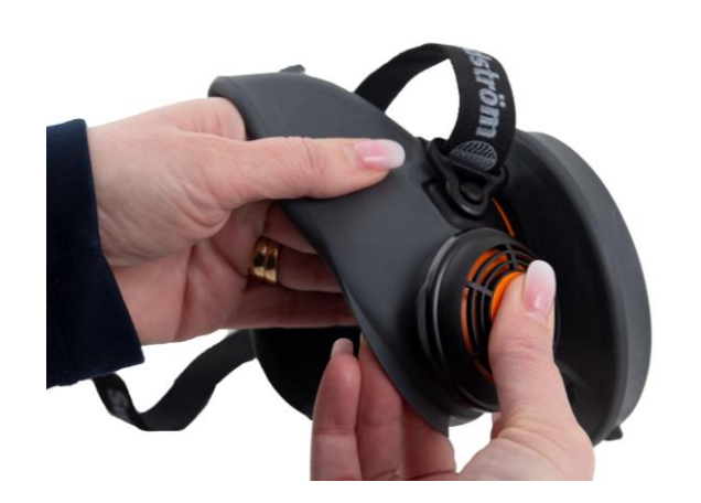
5.4 Press the new protective cap into place.