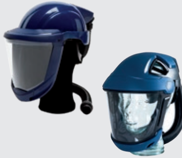
SR 580 Helmet with visor or SR 570 face shield with or without bump cap depending on work situation.