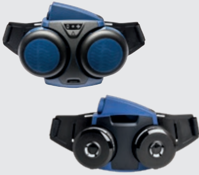
Fan unit SR 700 or SR 500.

Heavier workload and higher dust concentrations and for users that are clean shaven and with facial hair, beard or sideburns.